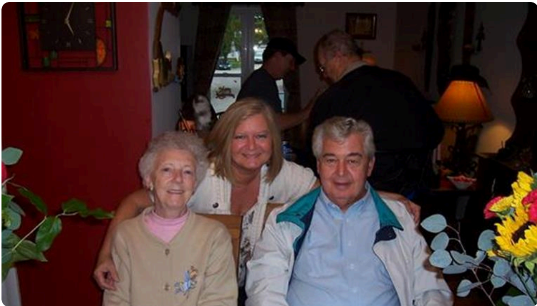
The greatest Uncle in the World