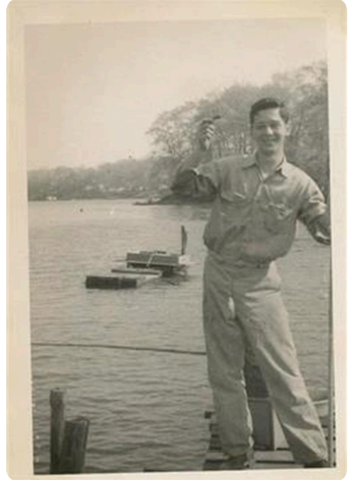
down the shore doing what he loved